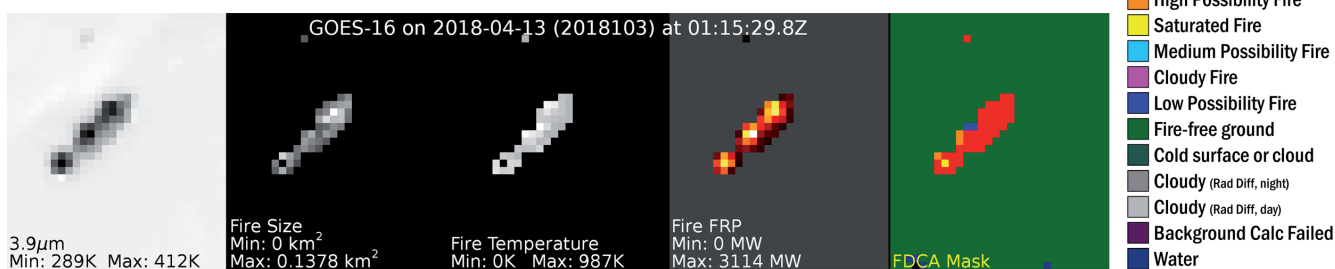
GOES-16 imagery of the Rhea Fire in Oklahoma on April 13, 2018, showing the ABI 3.9 \mu\text{m} shortwave infrared band (left column), and the various outputs of the fire detection and characterization product. From left: fire size, fire temperature, and fire mask. Fire radiative power is shown in colors from black to red for 0 to 1000 megawatts (MW), red to yellow for 1000 to 2000 MW, and yellow to white for 2000-3000 MW.

The FDC product looks for hot spots, attempts to determine the background temperature without fire present, corrects for solar contamination and water vapor attenuation, and provides fire characteristics for the detected